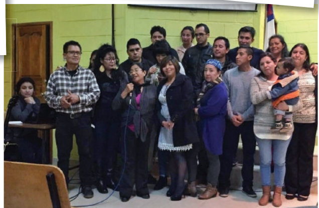
Maranata Young People

The week continued with more wonderful events and