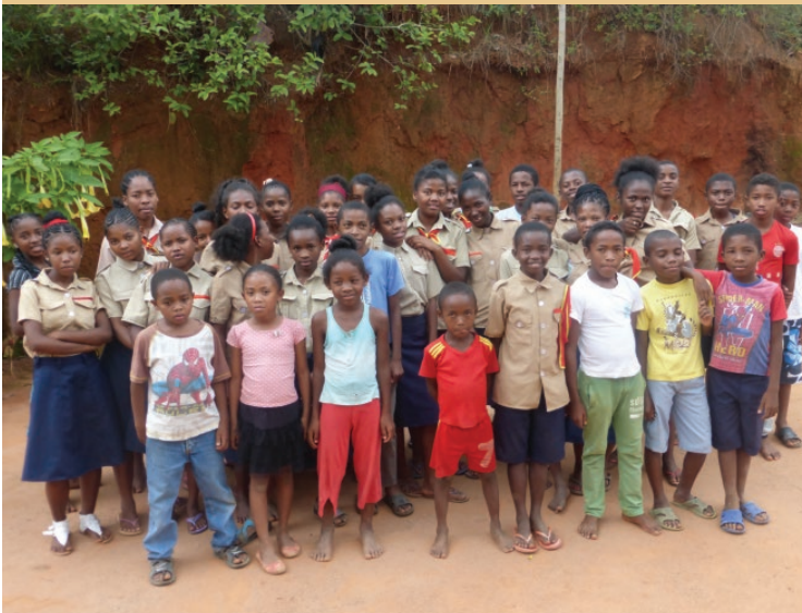
From top: Some of the orphanage children at play; A new building for the orphanage; The scout troop in Ambohimangakely.

tion system is weak; public schools are lacking and classes overloaded, with 80 or more children in a class. Moreover, teachers' salaries are not always paid on time. Many children are absent from school as they either help their parents work or beg on the streets. Often, parents are unable to pay the cost of school enrollment and materials. Private schools exist in the bigger cities for those who can afford them.