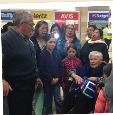
Arrival in Quito

Sleep that night was difficult since it had been such an emotional day. The next day, we ate a quick breakfast and