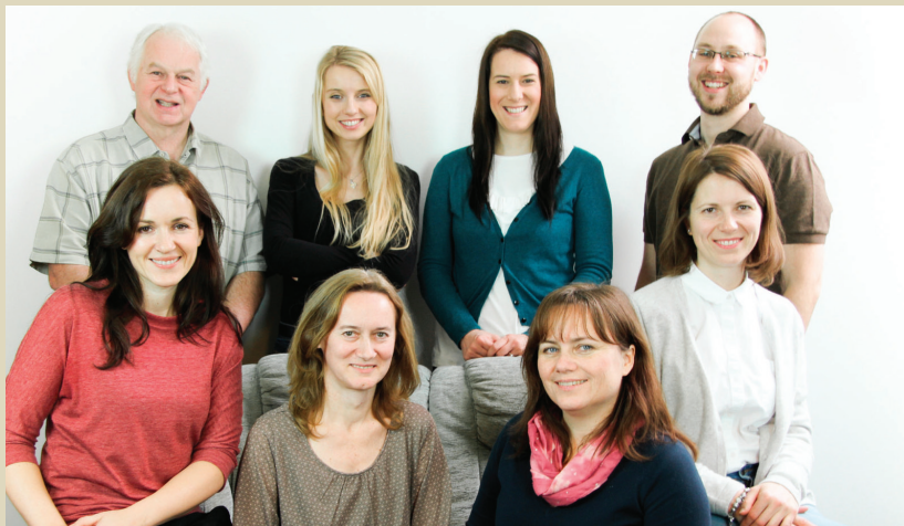
From top: Micro-enterprise client; Integra Slovakia staff.