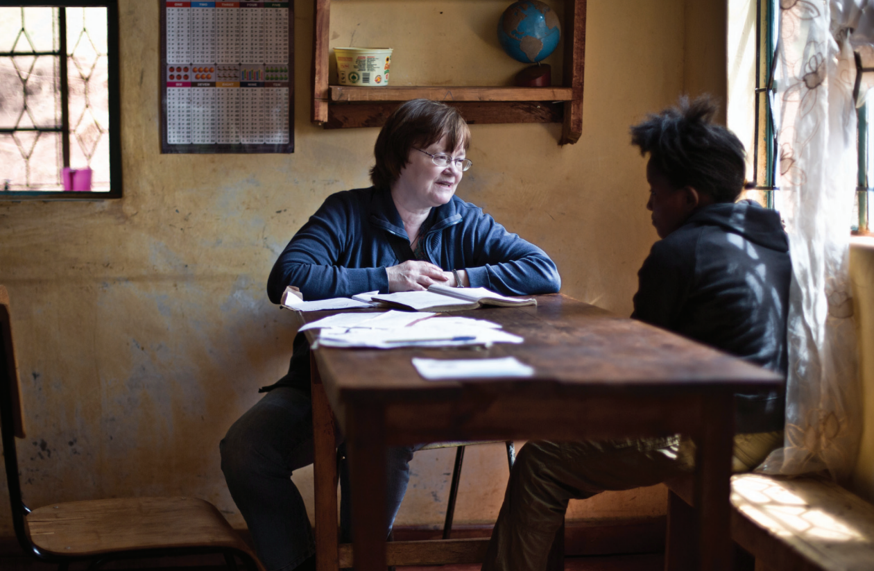
Caulene with a sponsored child in Africa.