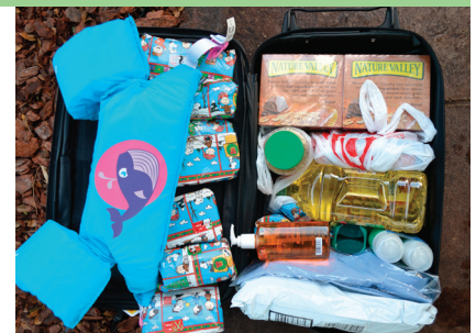
Left (from top): Sharing the Gospel at a public high school; My dad brought his unique set of skills to Jamaica. Right: Some supplies are not as affordable or available in other countries.

The apostle Paul's request for Timothy to bring his belongings to him was a very practical one that needed to be met. In the same manner today, many missionaries serve in areas where some of their everyday supplies are not as readily available. Some of these items can be purchased and shipped to their remote locations, but the process is usually associated with a significant cost and uncertainty of arrival. When I traveled to Jamaica I filled an entire suitcase with supplies that either were not available or were very costly when purchased in the country. I brought toiletries, food, and clothing along with a few gifts for their children. The delivery of these items brought smiles to each member of the family. What a tremendous privilege to witness firsthand the excitement of receiving such simple provisions.