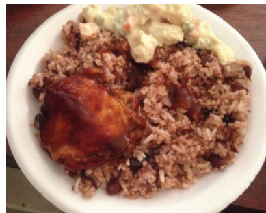
From top: Although still adjusting to aspects of life in Belize, the Waltons feel settled in their new home; The Waltons call Western Paradise Bible Chapel their home assembly; Now, the Waltons eat more beans and rice than ever; Despite the intense heat, Belize's beauty is striking.