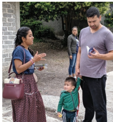
Opposite page: One young team member offers a woman a Gospel of John.