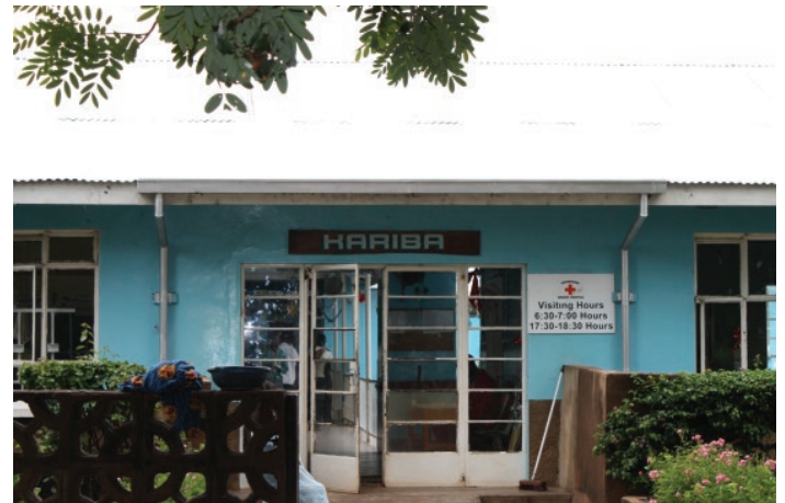
Above (from top): A group of women wait for literacy class to begin; In Zambia and nearby countries, Chitokoloki is well-known for its medical care.

At present, I continue to do both literacy and Bible teaching in addition to medical work. In recent years, my primary Bible studies have been at a village called Mutuwankayi and in my house.