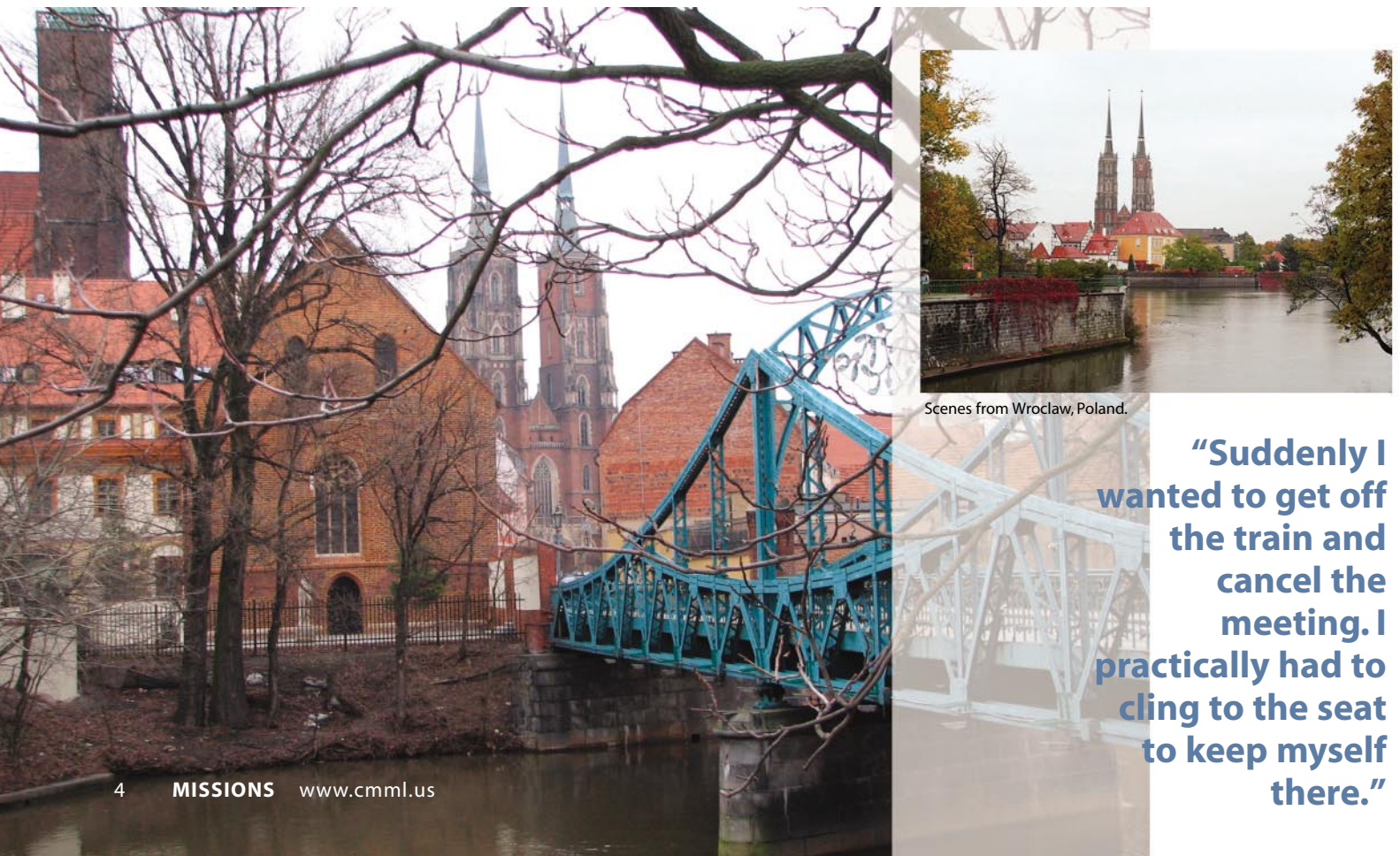
Scenes from Wroclaw, Poland.

A couple years passed, when a brother whom I did not know contacted me from Germany. He said, "We want to come to Poland to give out 30,000 tracts during the 2008 European