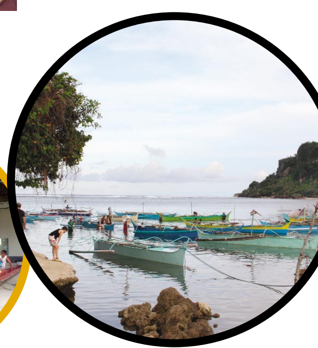
From left: A completed truss, waiting to be installed, sitting in the main worship area; Anthony Burrowes (from Australia) attaching the ladder trusses, with help from a local Filipino; The construction of the trusses and the full crew that was around to help; A local inlet where boats come with their daily catch.