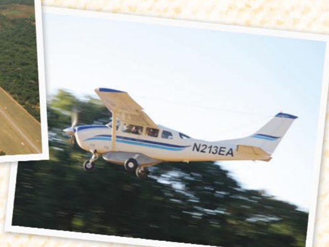
View from the plane (left). New plane (right and top). Erickson memorial (page 11).