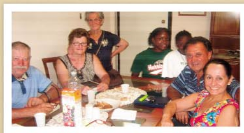
Left: Book gazebo. Above: Bible group in Borgo Podgora.

This new spirit has influenced another ministry we are involved in. Through the efforts of a group of young people from around Italy, we have seen the beginnings of a genuine movement among the youth. It is a movement that has been transformed from being typically entertainment-centered to genuinely Cross-centered. Who would have thought that youth from all denominations would start to gather together not because of the music or flashy preach-