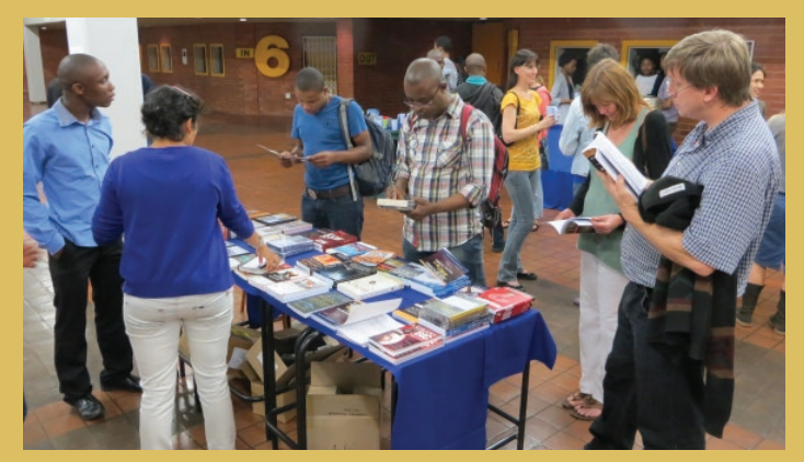
▲ Appropriate biblical literature ensures that people continue to grow in their understanding of creation.

Please pray for us as we seek to serve the Lord in South Africa and Zimbabwe through teaching God's Word, giving encouragement, and discipling. We ask you to pray that doors for sharing the Gospel will remain open and that ministries like Creation Ministries International will be free to teach the biblical view of origins in schools and other institutions. Our desire is that unbelievers will come to faith in the God who made them and in His Son, Jesus Christ, and that they will have full confidence in the Bible from the first verse.