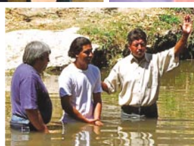
Top Row (L-R): Former students ministering in mountainous villages where they live; “Teacher, teach us more!”; Baptism in the muddy stream.