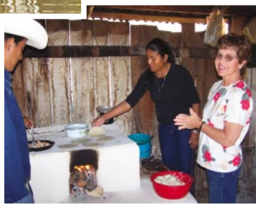
Bottom row (L-R): Personal help and encouragement; Breakfast before visitation to homes in the village.