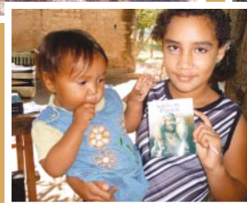
Bottom Row (L-R): Time alone with the Lord in the desert; Children's materials are so welcome – future missionaries!; New church starting in a village without a testimony.