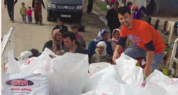
Left (L-R): Helping to make food bags; Registering refugee families. Above: Food bag distribution.