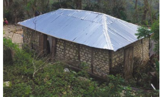
Far left: A woman carrying her new roof. Above/left: Wind-torn roof and after a new roof. Below from left: Explaining the contract; Installing the tin; A couple moving back into their home with a new roof.