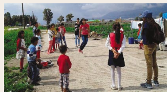
From top left: The Haven tent; Song time; Mealtime at the Haven; Game time.