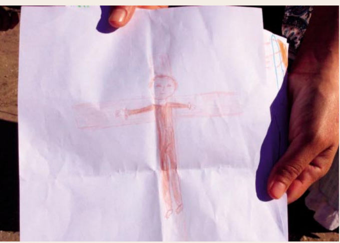
From top: The drawing of the bombed house; The man who wants to stop war.