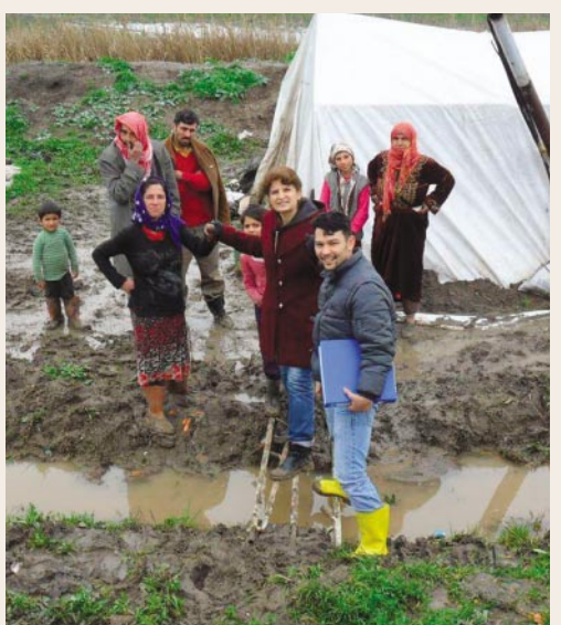
From left (top to bottom): Giving out new boots; Delivering foam mattresses; In a refugee tent; Refugee tents in the winter; New boots for winter.