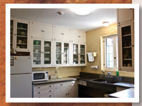
Hundreds of missionaries enter through CMML's beautiful doors each year. The guest rooms and kitchens offer comfort and refreshment.

Do you ever wonder what it is like to stay at the CMML Missionary Guest Home? During our years of missionary service in the Philippines, we deliberately planned a visit to the home in Wall Township, New Jersey, anytime we were in the United States because we knew that it was a cozy haven with peace and quiet. Now, some 30 years later, we count it a privilege to provide the same kind of service to commended workers looking for a place to rest, refresh, and prepare for their next steps.