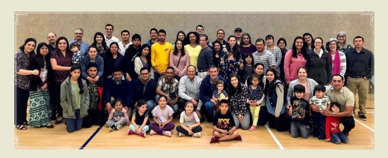
Elders and Deacons meeting 2019

This year we had the opportunity again to host the leaders meeting in Eugene. It was a very pleasant time that we spent in fellowship with several brothers who work as elders, deacons and those who are prospects to become future leaders in each of the respective churches. We continue to ask for your prayers so that the Lord sustains the current leaders and also that in the future, He will raise those whom He will choose and enable to function and collaborate with us to serve the Lord taking care of His work.