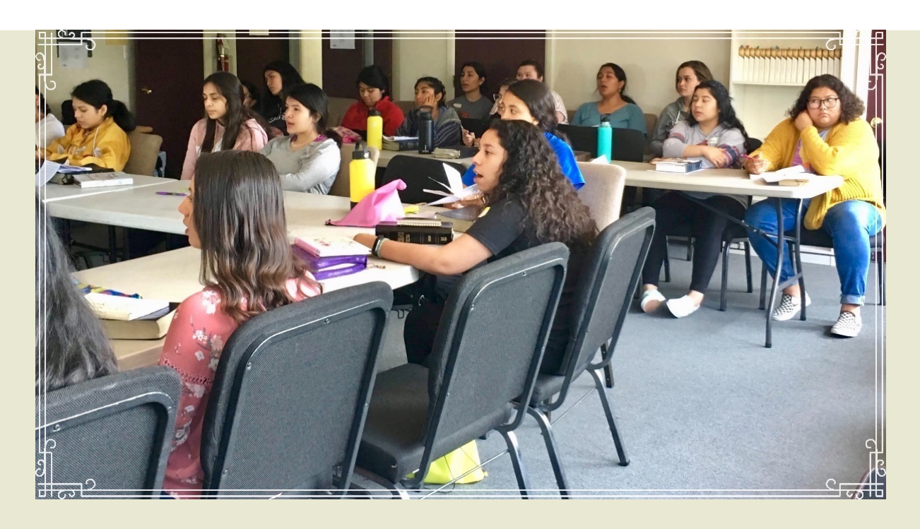
Young girls during teachings

This year we had the opportunity again to host the leaders meeting in Eugene. It was a very pleasant time that we spent in fellowship with several brothers who work as elders, deacons and those who are prospects to become future leaders in each of the respective churches. We continue to ask for your prayers so that the Lord sustains the current leaders and also that in the future, He will raise those whom He will choose and enable to function and collaborate with us to serve the Lord taking care of His work.